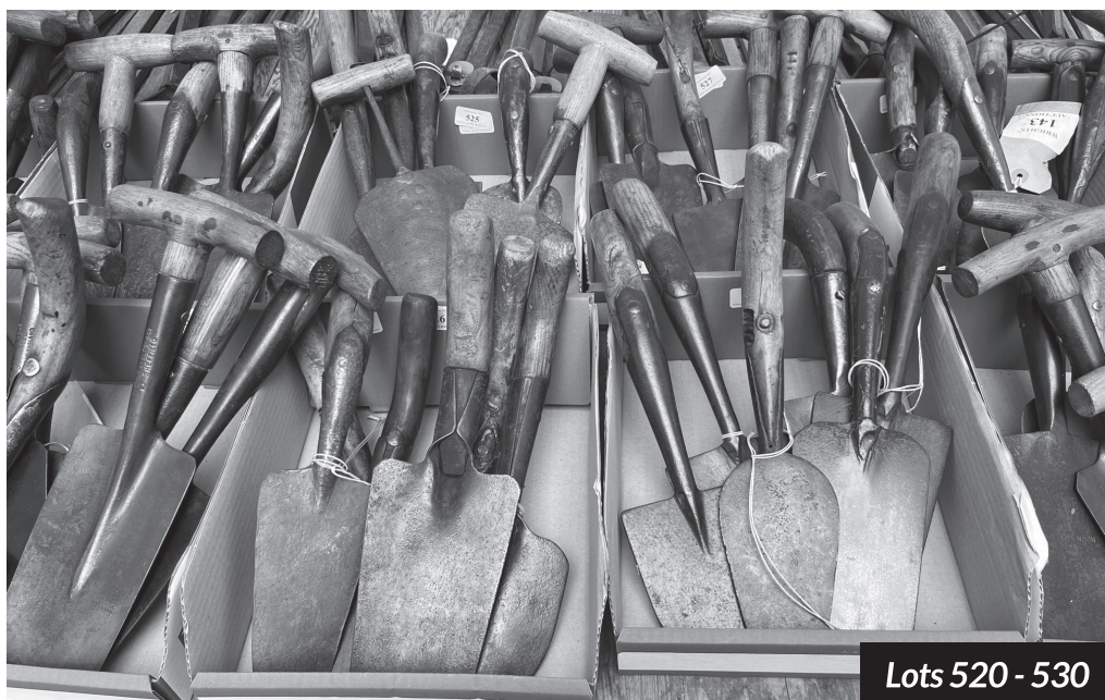
Lots 520 - 530