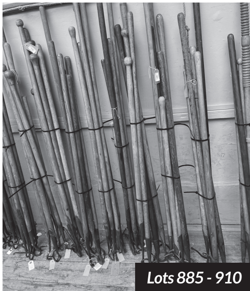
Lots 885 - 910